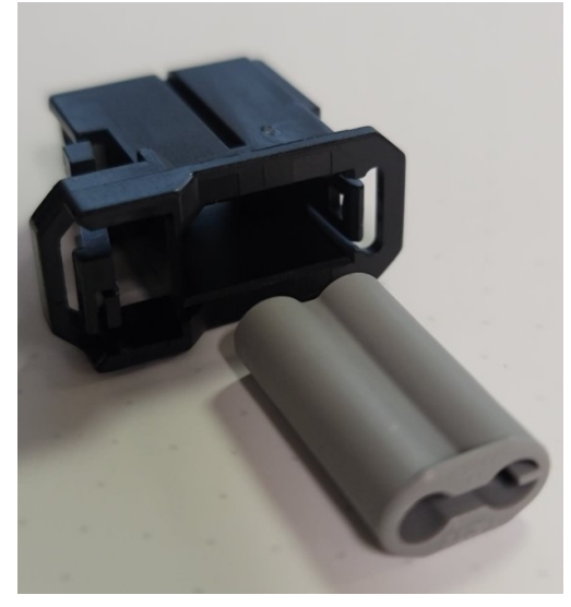
Figure B 6/7/21