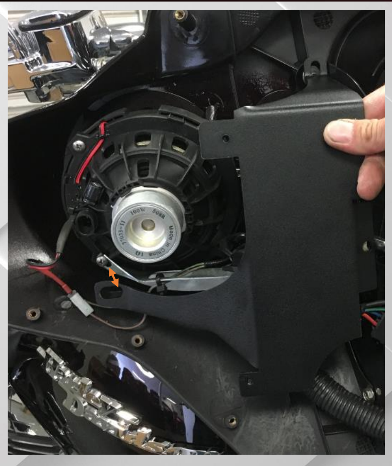
[ NOTE: Some models may require the upper support to be modified to bolt to the inner Fairing upper fastener.]