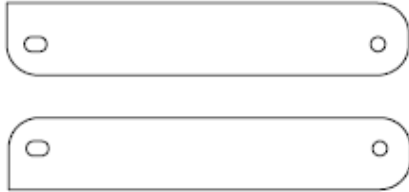
Outer Fender Gaskets